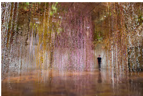
Installation view of Community , 2018 Toledo Museum of Art, Ohio, USA

Celebrating nature in the city. The Flower Power Festival Munich 2023 will take place under this motto from 3 February to 7 October next year. The Kunsthalle München, the Gasteig, Europe's largest arts centre, the Botanical Garden Munich-Nymphenburg and BIOTOPIA – Naturkundemuseum Bayern are the initiators of the city-wide festival, in which everyone can take part, whether large institutions, small associations, renowned cultural institutions or private initiatives.